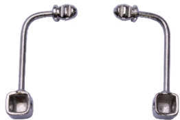
Raw (material color)