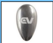
Laser engraving "deep"