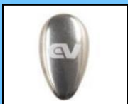
Laser engraving "only surface marking"