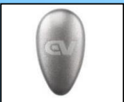
Laser engraving "deep" (Matt surface)