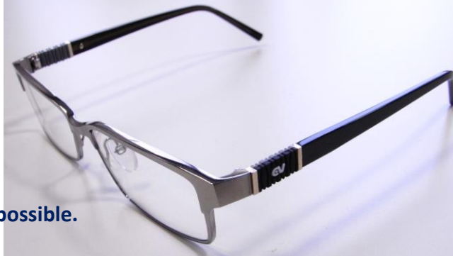
Metal front is also possible.