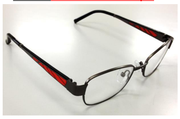
<u>Silicone + Sheet metal temple</u>