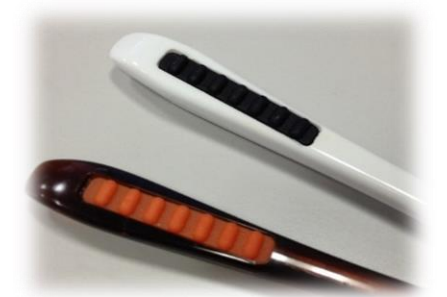
Silicone + acetate temple