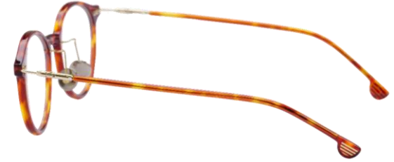
LINEA V2 Material: Acetate (Wire core: stainless steel)

We have an acetate temple tip with UP sticker.