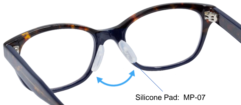
Silicone Pad: MP-07

Non-allergenic, non-slip silicone nose pad. The height of the nose pad can be lowered by 2.0 mm, only by exchanging the left and right pads.