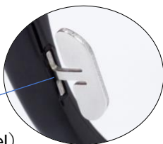
Insertion pad arm: MPA-07 (stainless steel)