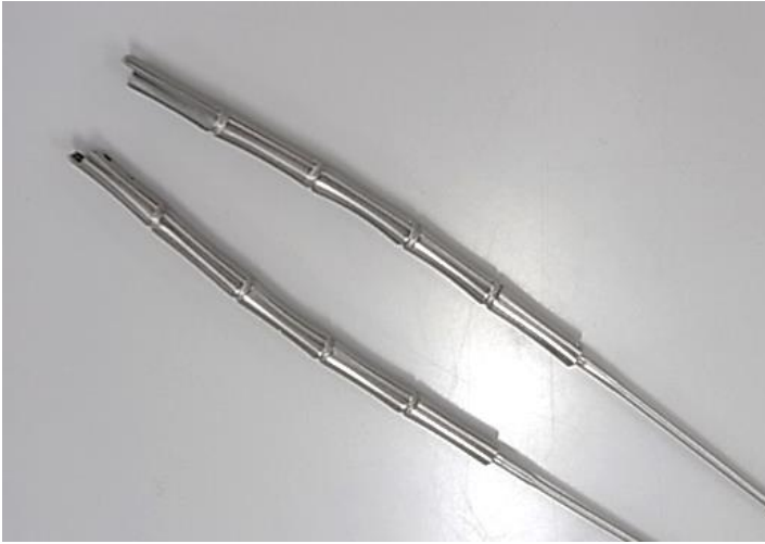
Titanium temple like "bamboo design"