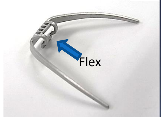
Beta titanium part with "flex" function