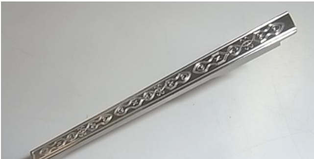
Titanium one-piece spring temple Very detailed press pattern