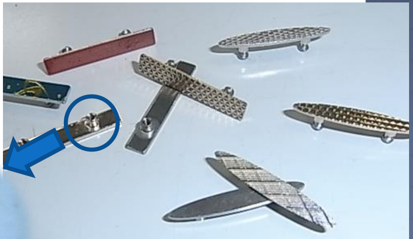
Titanium decoration with tube "one-piece construction"

Combination with DIAMOND CUTTING / ART PRINT